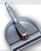
Dust pan &amp; brush set