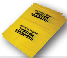
Waste disposal bags