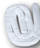
Socks 3m x 8cm