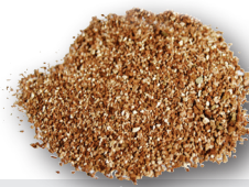
30L Bags of absorbent