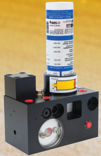
257660020202 HAMAX2 standard - standard version Type F (with Fuchs Meissel paste cartridge)